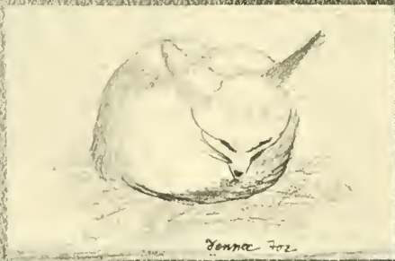
FROM PENCIL DRAWINGS BY CHRISTINA ROSSETTI. Animals in the Zoological Gardens, London, c. 1862.